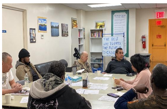
Chance for Change group session