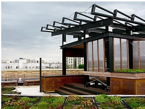
Louis Nine House green roof

Our neighborhood-focused Street Sheets are pocket-sized guides that provide information about meal programs, shelters, drop-in centers, legal services, medical care, and more.